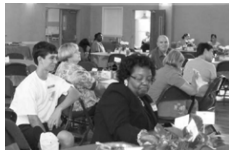
Fields to Families supporters enjoyed lunch and a chance to meet face-to-face — in many cases, for the first time — on October 5 at the appreciation event.